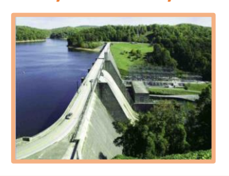
Big Ws: River uses hydroelectricity

> Rivers are used in a variety of ways in different places.